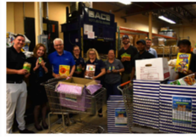
April 2024 Boca Helping Hands Food Drive and Volunteer Day