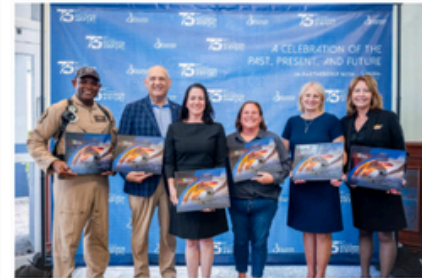
August 2024 75th Anniversary Coffee Table Book Release Party View the book here .