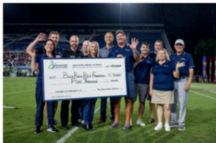
October 2024 Donation to the Boca Raton Police Foundation