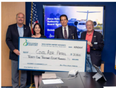
October 2024 Donation to the Civil Air Patrol