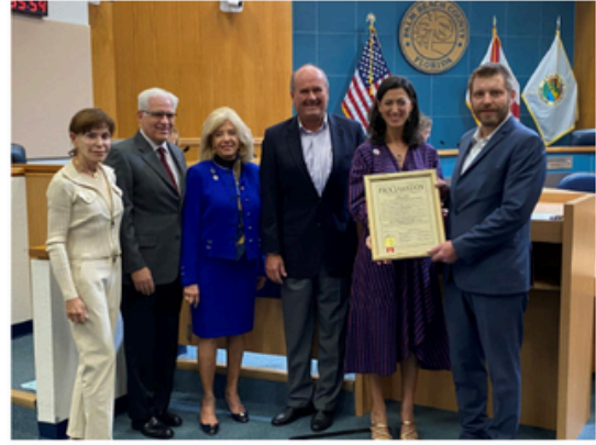
January 2024 Proclamation from the Board of Palm Beach County Commissioners