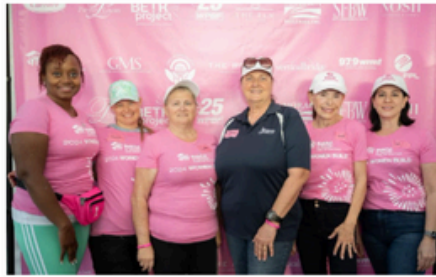
March 2024 Habitat for Humanity's Women Build