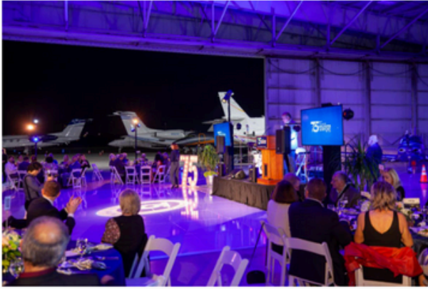
January 2024 75th Anniversary Past, Present, and Future Reception and Dinner