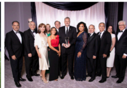
November 2024 Proud Sponsor for the Boca Raton Mayors Ball