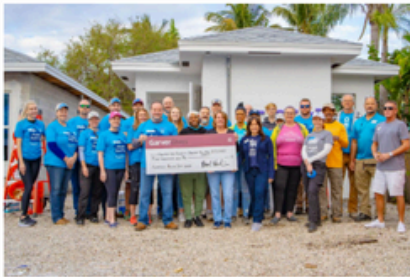
February 2024 Aviation Build Day supporting Habitat for Humanity