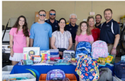
July 2024 Spirit of Giving Back-to-School Drive