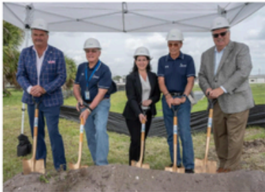
July 2024 Observation Area Groundbreaking Ceremony