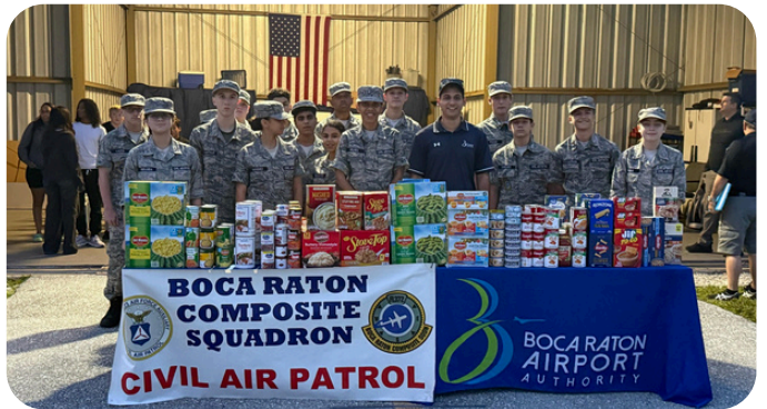
November 2025 Civil Air Patrol's Thanksgiving Food Drive