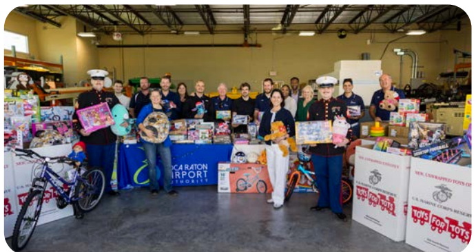
December 2025 9 th Annual Toy for Tots Drive