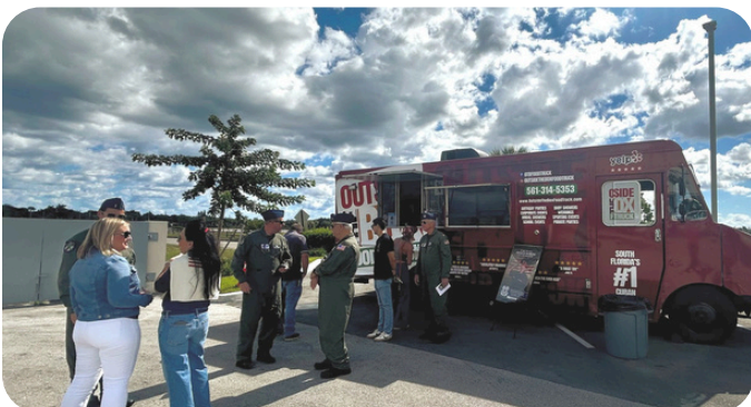
November 2025 Coast Guard Auxiliary Fly-In Food Truck Fundraiser