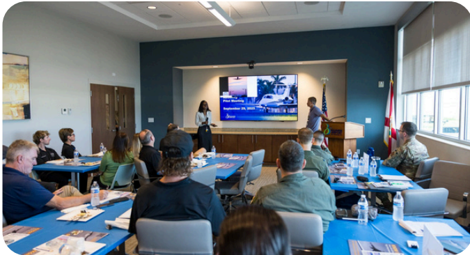
September 2025 Pilot's Meeting