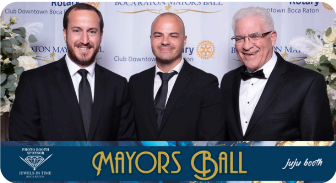
November 2025 Boca Raton Mayors Ball