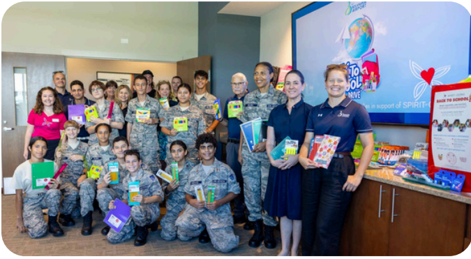
August 2025 Spirit of Giving's Back-to-School Drive