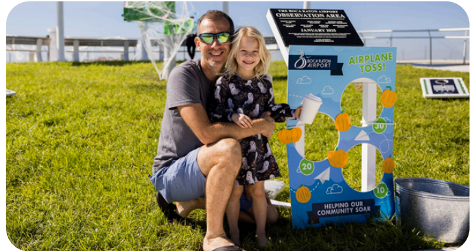
October 2025 Pumpkin Hunt at our Observation Area