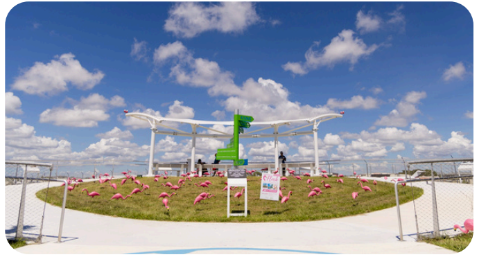
August 2025 Boca Centennial's Follow the Flock